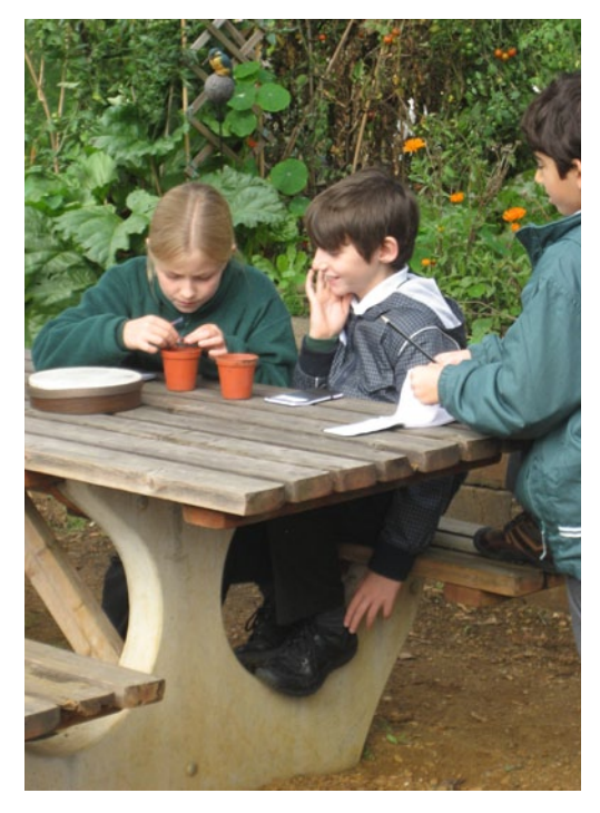
Pupils investigate the role of earthworms in soil on a Darwin Inspired gardening day.

It is important that Darwin's scientific work is linked with the decisions that pupils make now and in the future. There are opportunities for everyone to express an opinion. Group work is encouraged both indoors and out-of-doors. How teachers achieve the most effective grouping is a strategic choice, but all activities, however short, should have clear outcomes and a specified time limit.