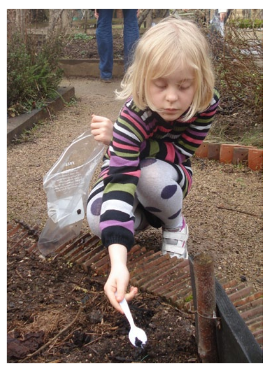
Collecting soil samples.

Teachers need to read the appropriate local authority and school guidelines. Before making a visit they should carry out a risk assessment and a preliminary visit. Where a specific issue has been anticipated, it is highlighted in the Notes for teachers.