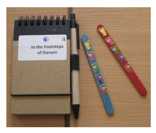
An example of a Darwin notebook and memory sticks.

Pupils answer the questions they raised earlier and present their evidence and reasoned arguments using a range of media.